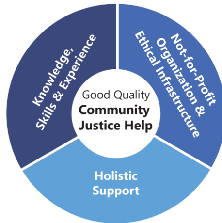
Figure 2: Good Quality Community Justice Help Features

Good quality community justice help matches the needs of clients, the competencies of the workers (operating within not-for-profit, ethical organizations), and the broader context of available supports in communities.